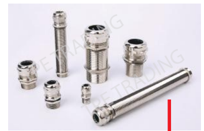
Can add more Thread Length (GL) - Optional*